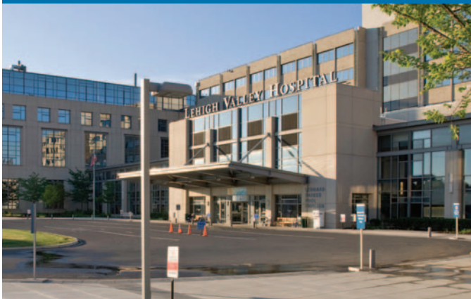
Lehigh Valley Hospital-Cedar Crest

Lehigh Valley Health Network is dedicated to providing Lehigh Valley youth with exposure to health care careers through high-quality educational programs.