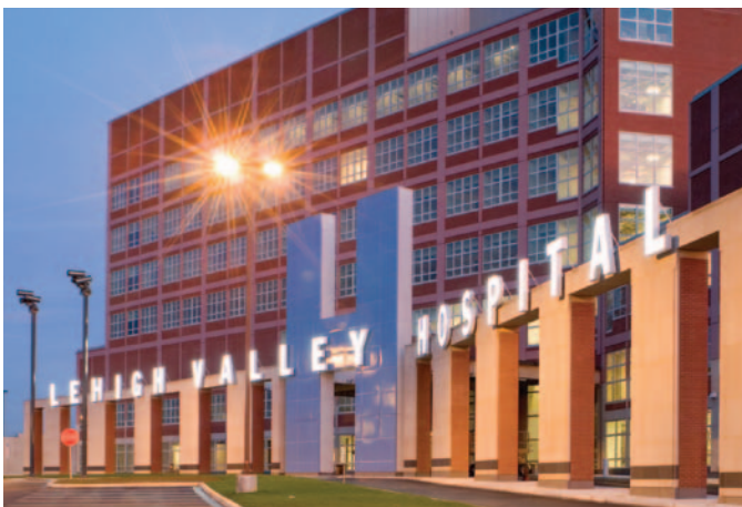
Lehigh Valley Hospital-Muhlenberg