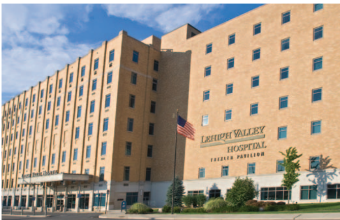
Lehigh Valley Hospital-17th Street