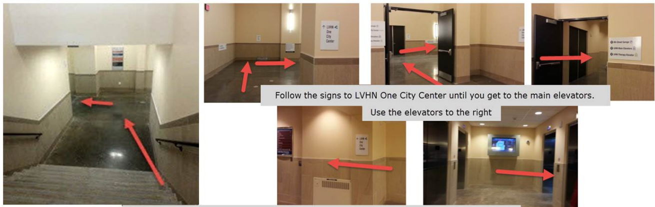
At the end of the steps, turn left.