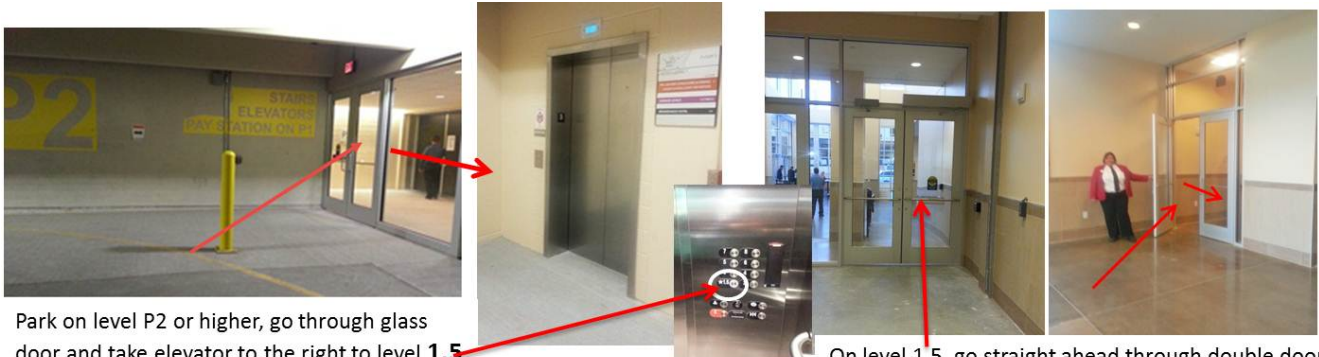
Park on level P2 or higher, go through glass door and take elevator to the right to level 1.5

- Park in the Linden Street Garage , pull a ticket upon entrance. Take Garage Elevator to Level P2. Once on Level P2 proceed through the solid set of double doors to the Arena Elevator. Take the Arena Elevator to Level 1. Follow signs in the Level 1 arena block connecting corridor for LVHN–One City Center. The corridor will pass by the arena ice entrance and hotel elevators and end in LVHN–One City Center. Follow signs to the blue LVHN Main Elevators. Select Lobby (level 2) and stop at the guest services desk to sign in.