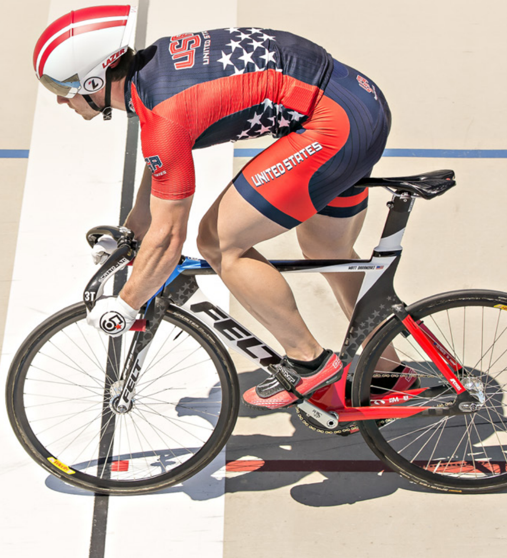
Matt Baranoski USA Track Cyclist, 2016 Rio Olympics